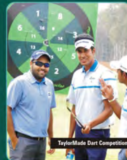
TaylorMade Dart Competition