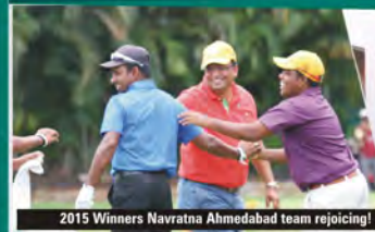
2015 Winners Navratna Ahmedabad team rejoicing!