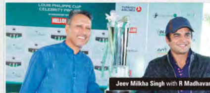
Jeev Milkha Singh with R Madhavan