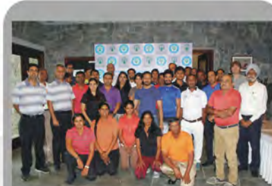
Delegates & Speakers at 2nd IGU – NGAI Teaching Summit at DLF Golf & Country Club