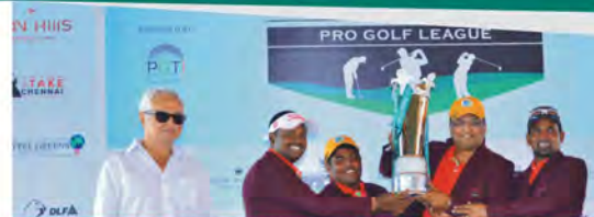
LOUIS PHILIPPE CUP 2015 WINNERS NAVRATNA AHMEDABAD