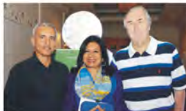
AFTER HOURS GOLF