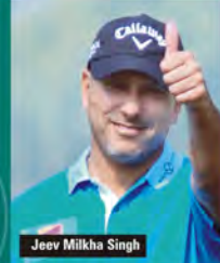
Jeev Milkha Singh