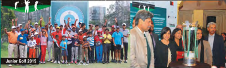
Junior Golf 2015