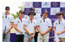
KNIGHT GOLF 2016