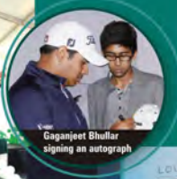
Gaganjeet Bhullar signing an autograph