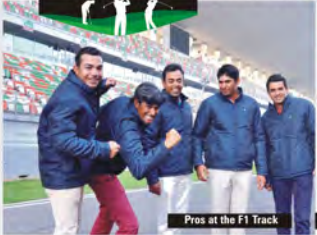
Pros at the F1 Track