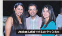
Anirban Lahiri with Lady Pro Golfers