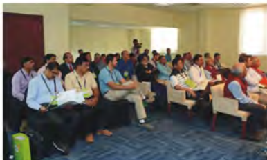
INDIA GOLF EXPO

RN Sports Marketing (RNSM) is a company engaged in partnering leading corporates in Marketing & Brand Positioning solutions using Golf as the communication platform as well as working with various institutions to develop prestigious national and international tournaments and programs.