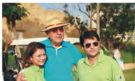
MADHAVRAO SCINDIA GOLF TOURNAMENT