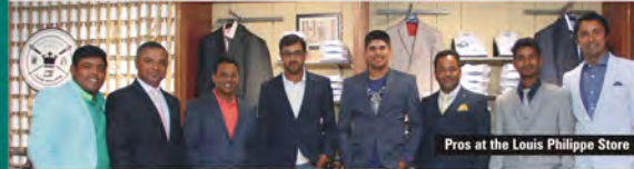
Pros at the Louis Philippe Store