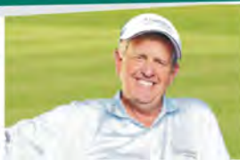
HERO CYCLES GOLF CUP HOSTED BY COLIN MONTGOMERIE