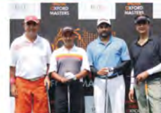
WESTERN INDIA OXFORD MASTERS