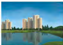
Star Court Apartments

Jaypee Greens Greater Noida , with 85% green area, offers one of the highest proportions of greenery vis-à-vis the constructed area. It offers ready-to-move-in apartments, amidst the 18-hole Greg Norman designed golf course , 60 acre nature reserve and many other entertainment and recreation options.