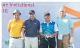
ACCENTURE INVITATIONAL CUP