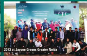
2013 at Jaypee Greens Greater Noida