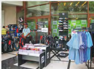
All major Golf brands offered exclusive deals at the pro shop