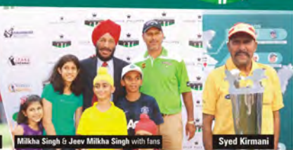
Milkha Singh & Jeev Milkha Singh with fans