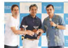
STANDARD CHARTERED SOUTH ASIA GOLF TOURNAMENT