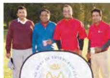
DUKE OF EDINBURGH CHARITY GOLF