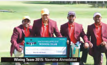
Winning Team 2015: Navratna Ahmedabad