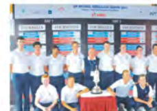
SIR MICHAEL BONALLACK TROPHY 2014