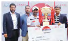
TAKE INDIA MASTERS