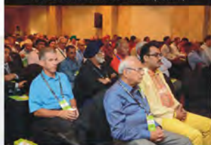
Delegates in attendance at the IGIA Conference & IGU-GCS & MAI Turf Care Seminar (Bottom)