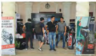
Customers shop through various Golf equipment and apparel on sale

India Golf Expo 2016 is South-Asia's largest golf exposition organised on 20 – 21 April 2016 at DLF Club 5, Gurgaon. 50 of India's leading Golf Clubs, 40 of India's top Golf coaches, over 40 superintendents, greens keepers and over 400 delegates from India and abroad representing over 20 nationalities were in attendance. More than 2000 visitors thronged the expo and witnessed the world's leading golf brands showcase their products and equipment. The India Golf Expo was organised by Indian Golf Industry Association (IGIA), supported by the Indian Golf Union (IGU), National Golf Academy of India (NGAI) and Golf Course Superintendents & Managers Association of India (GCS&MAI) & the Ministry of Tourism. The expo featured a two day symposium and an exhibition along with IGU-GCS&MAI Turf Care Seminar and IGU-NGAI Teaching Summit, concurrently.